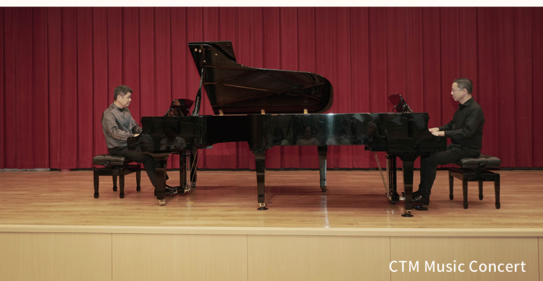
CTM Music Concert

Surely, the main reason for coming to TSMC Building is to learn, and a good learning environment is essential for effective studying. Last year, the university conducted renovations on the 1st to 3rd floors, most frequently used by undergraduates. Notably, Room