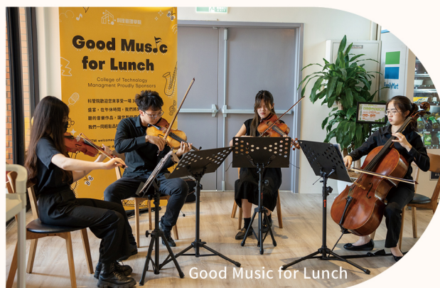
Good Music for Lunch