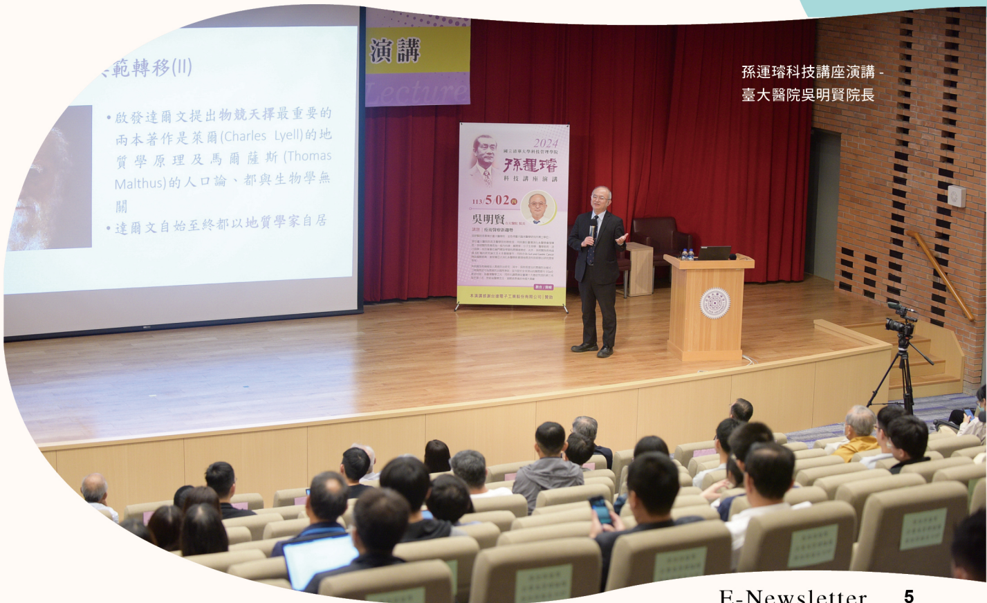
孫運璿科技講座演講 - 臺大醫院吳明賢院長

上述各個台積館的小知識、小技巧記起來了嗎？除了以上四大重點之外，台積館還有更多地方、趣事，期待各位同學自己去探索、發掘喔！