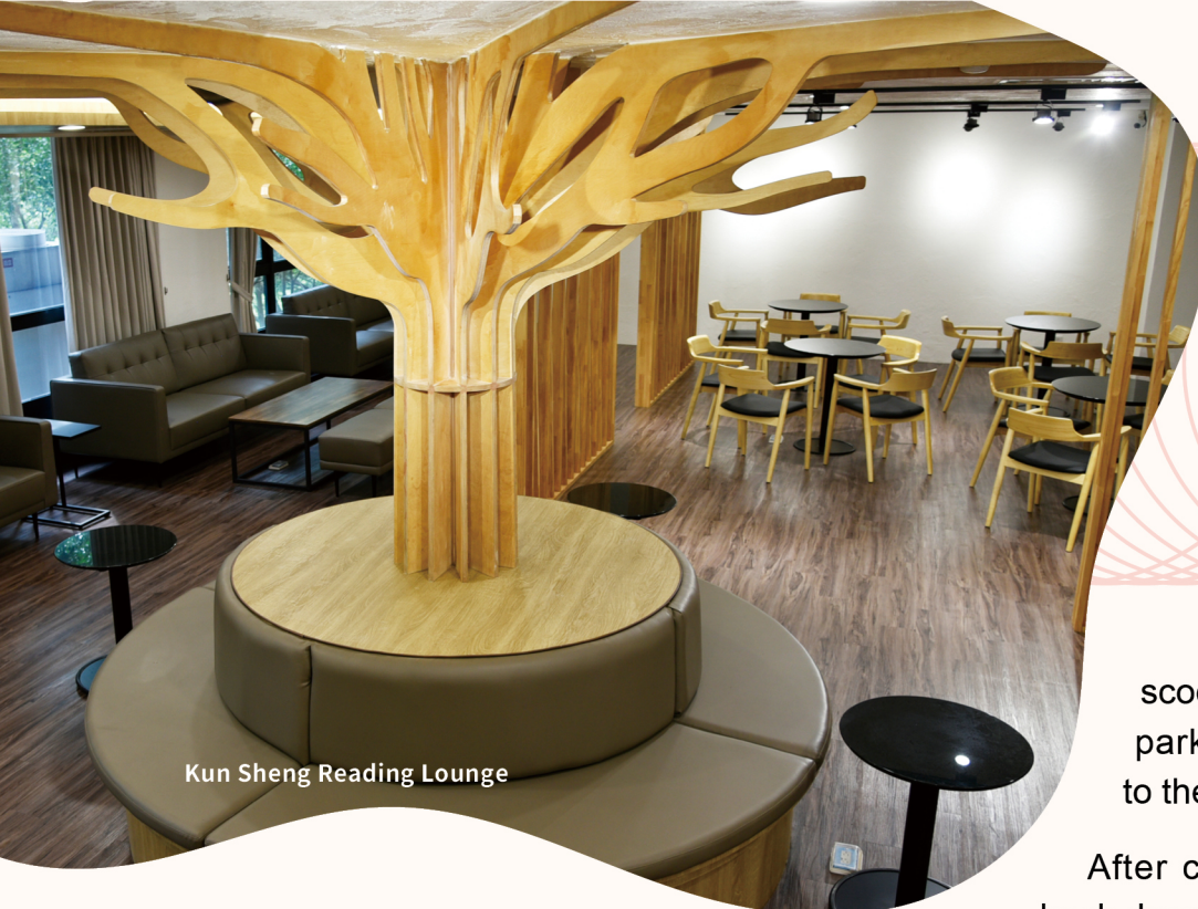
Kun Sheng Reading Lounge