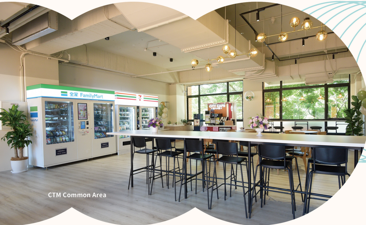
CTM Common Area