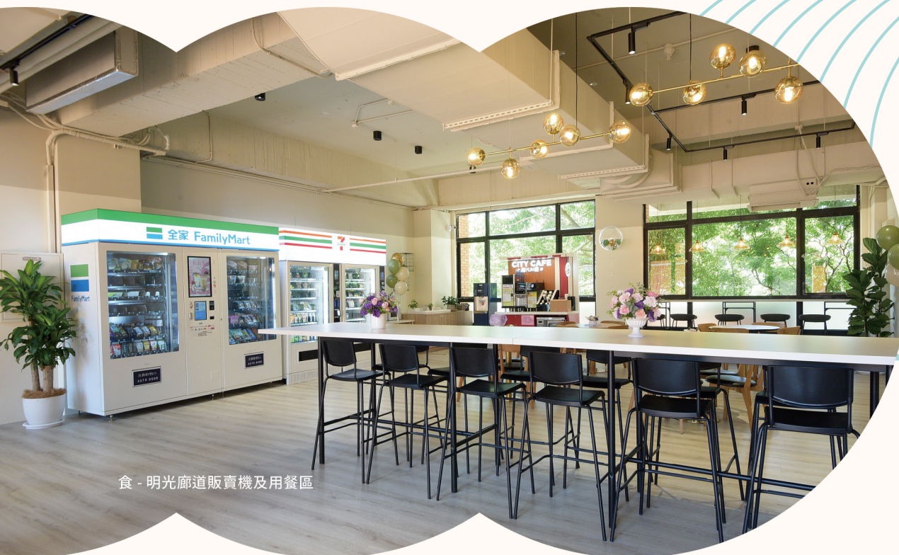
食 - 明光廊道販賣機及用餐區