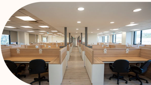
Tsung-Ching Reading Lounge

As the saying goes, "food is paramount." Since TSMC Building is located next to the South Gate, reaching the dining areas on campus requires a special trip down the hill. If you have afternoon classes and need to return to the TSMC Building, you'll need to travel back up, which can be time-consuming. Many students choose to buy their meals from the FamilyMart and 7-11 vending machines in the CTM Common Area on the first floor. Additionally, some students head to the Bao Shan Road shopping street for food and drinks, while others prepare their own lunchboxes and use the microwaves during open hours to enjoy a hot meal!